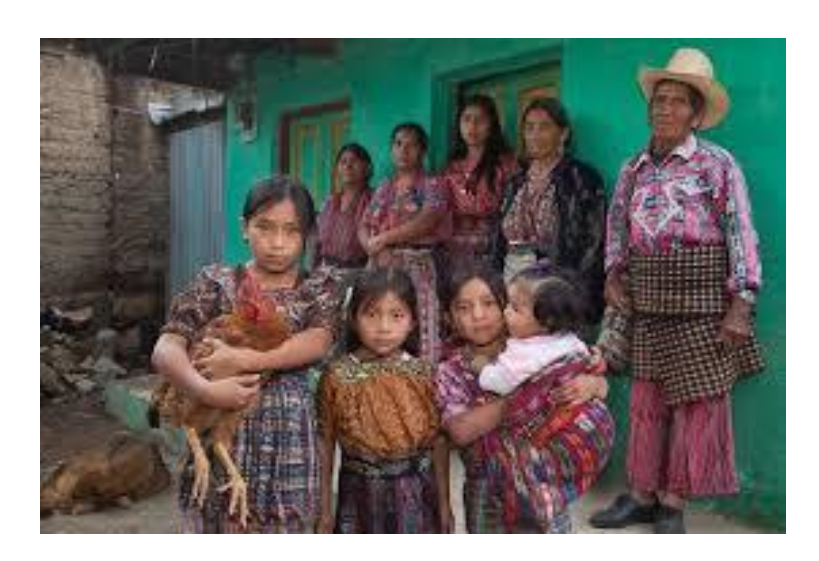
Where did the Maya People live

The Maya are a culturally affiliated people that continue to speak their native languages and still often use the ancient 260-day ritual calendar for religious practices. The ancient Maya were united by belief systems, cultural practices that included a distinct architectural style, and a writing system. The Maya are an indigenous people of Mexico and Central America who have continuously inhabited the lands comprising modern-day Yucatan, Quintana Roo, Campeche, Tabasco, and Chiapas in Mexico and southward through Guatemala, Belize, El Salvador, and Honduras