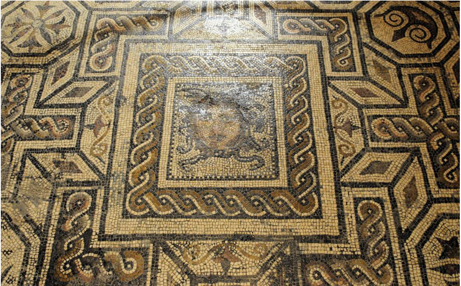
Photo courtesy of Son of Groucho (@flickr.com) - granted under creative commons licence - attribution