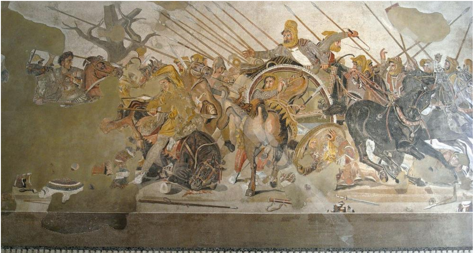
Photo courtesy of kudumomo (@flickr.com) - granted under creative commons licence - attribution

Some mosaics had pieces cut down to 1-2mm for very intricate patterns. This is the Alexander mosaic that you can still see today in Pompeii, Italy.